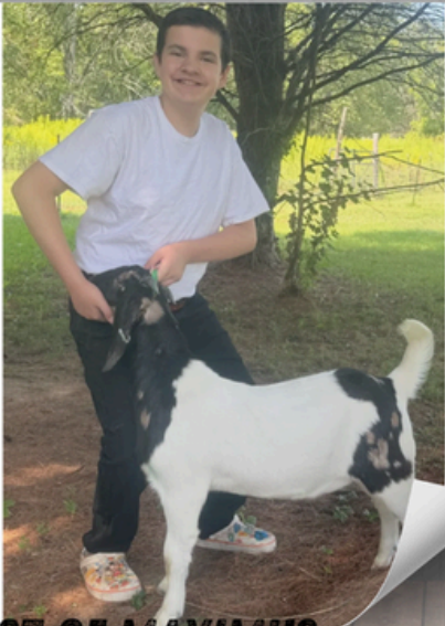
GHOST OF MAXIMUS