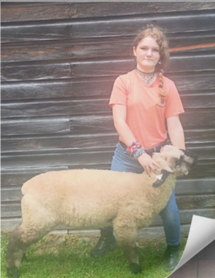
GEDRICK THE LAMBENATOR